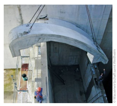
Figure 6: Reinstallation of individual segments of the overflow sill on the new spillway (after elevation)