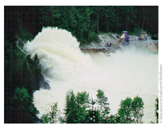
Figure 2b: New spillway: first use of the new spillway with 260 m<sup>3</sup>/s over the ski-jump on 23 May 1999

Work on the intake structure took place alongside tunnel excavation. The pit, which was 32 m long and up to 30 m deep, was created in 2 m sections by blasting into the compact dolomite. Since a main road runs very close to the construction site, work could only be performed with a significant amount of effort to secure the site. The walls of the pit are strengthened with a total of 148 permanent anchors (anchors are a maximum of 25 m long). Work to concrete the 1.50 m-thick floor of the structure could not begin until April 1996 once extremely heavy icicles on the walls of the excavation pits had melted. The rising walls were concreted directly against the bedrock in the lower section up to a height of 4 m. Higher sections of the wall were created with formwork on both sides.