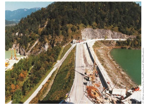
Figure 5: Construction of the crest wall and banking for the elevated section of the dam