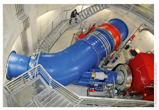
Figure 7: Compact axial turbine at hydropower station II

raftwerke GmbH operates the hydropower stations with local staff from the Weilheim water authority.